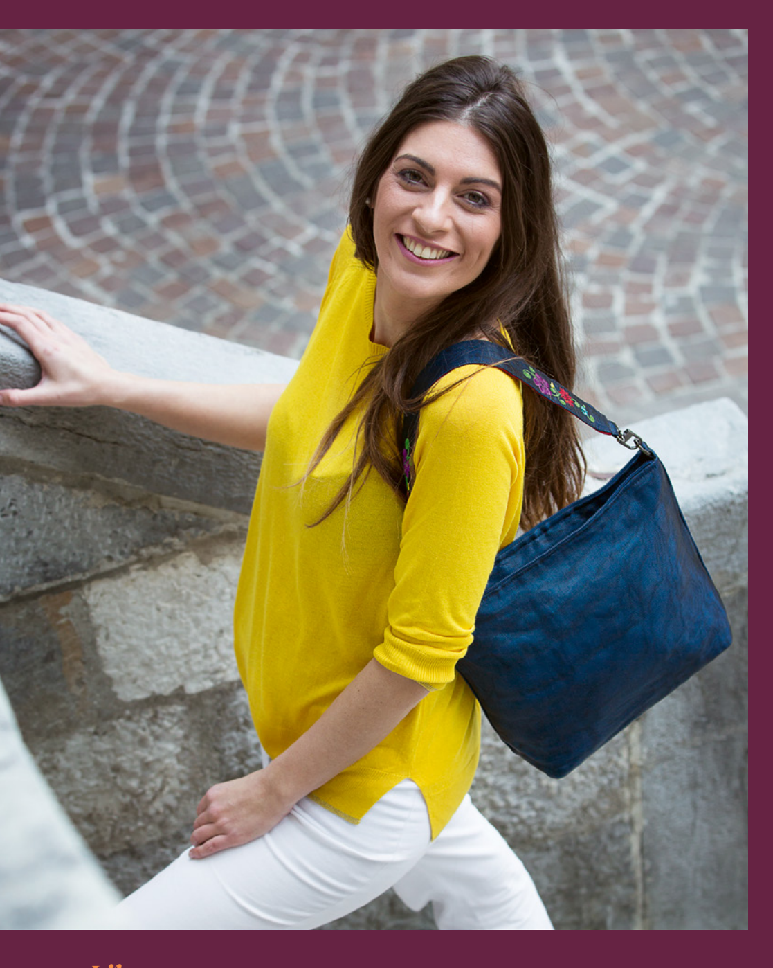
Lily Ref. B374-NET Shoulder bag Dark Blue – Repurposed net Strap Iris